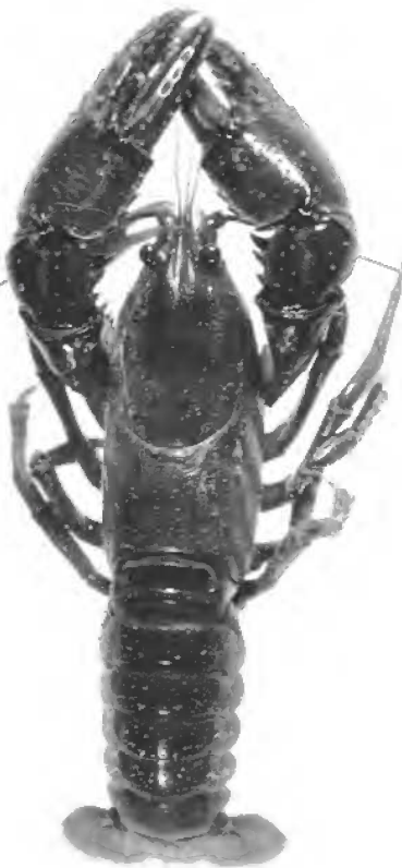
Figure 2. Euastacus mirangudjin n.sp. Dorsal view, holotype.

Description. Maximum OCL 37 mm. Rostrum —short, just reaching base of third antennal segment, with a distinct and deep longitudinal groove; rostral margins parallel at sides and divergent at base; rostral carinae short; 3 marginal rostral spines per side, extending beyond midlength of rostrum (paratype with 2 spines on one side); acumen spine similar in size to marginal spines; OCL/carapace length = 0.88; rostral width/OCL = 0.14–0.17. Cephalon —weakly spinose; antennal squame marginal spines absent; 1st postorbital ridge spine small to medium, 2nd postorbital ridge spine barely discernible (ridge reduced to a subtle bump on carapace); numerous small to medium, blunt cephalic spines ventral to postorbital ridges; suborbital spine small to medium in size; interantennal scale of medium width and scalloped; basipodite spine absent or small; coxopodite spine small to medium and occasionally bifid; interantennal scale length/OCL = 0.09–0.1. Thorax —1–5 cervical spines per side, barely discernible or very small; thoracic spines absent or barely discernible; general tubercles dense and small; areola length/OCL = 0.35; areola width/OCL = 0.13–0.14; carapace width/OCL = 0.53–0.55; carapace depth/OCL = 0.47–0.54. Abdomen —1–5 Li spines on somite 2, 1 barely discernible or absent on other somites;